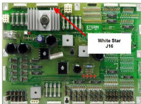
White Star J16

Now you can connect your mods to the power supply using the power tap. Wire cutting is not necessary!